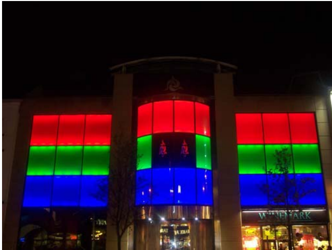
Installation by PSD Electronics, pictures courtesy of Wine Inns